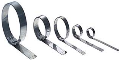
Junior® Smooth I.D. Clamps are available in 46 sizes in various materials to meet all your needs.

The World's Leader in Quality Engineered Band Clamping Systems.