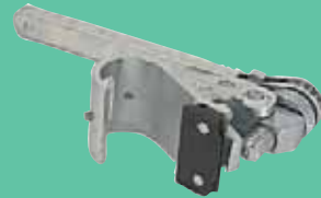
J05069 Junior® Heavy Duty Adaptor