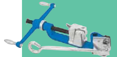
C00269 Junior® Hand Tool