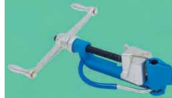
C00169 BAND-IT® Tool

Junior® Non-Smooth ID Clamps are available, however BAND-IT recommends using the BAND-IT Jr.® Smooth ID Clamp in place of the Junior® Non-Smooth ID Clamps.