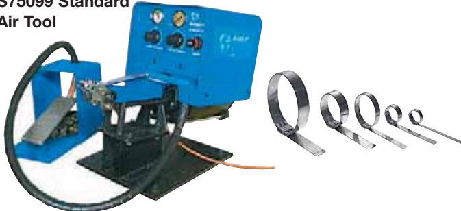
S75099 Standard Air Tool