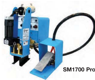
SM1700 Production Tool