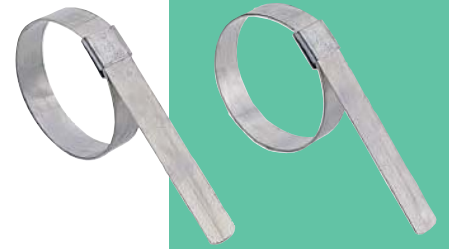
Center Punch Preformed Clamps