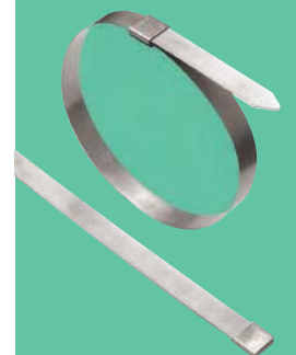
BAND-FAST™ Open End with Center Punch Clip

*BAND-IT reserves the right to substitute material with equal or better corrosion resistance and/or mechanical specifications.