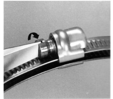
3. Pull band snug around object, insert screw, tighten and cut off finished clamp