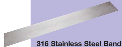
316 Stainless Steel Band