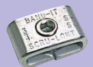
Stainless Steel Scru-Lokt Buckle