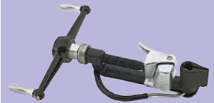
C00369 BAND-IT® Heavy Duty Tool For product information see page 13.

*BAND-IT reserves the right to substitute material with equal or better corrosion resistance and/or mechanical specifications.