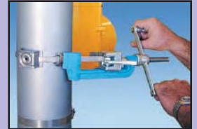
C00169 BAND-IT® Tool For product information see page 13.