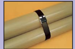
316 Coated Stainless Steel Band