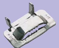
316 Stainless Steel Ear-Lokt Buckle