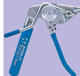
C07569 Bantam Tool For product information see page 13.