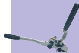
C40099 Ratchet Tool For product information see page 13.

*BAND-IT reserves the right to substitute material with equal or better corrosion resistance and/or mechanical specifications.