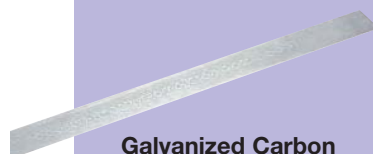
Galvanized Carbon Steel Band