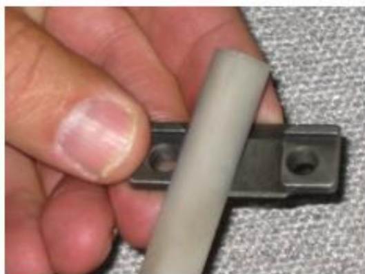
Hand polishing cutter blade with a fine stone.

The World's Leader in Quality Engineered Band Clamping Systems.