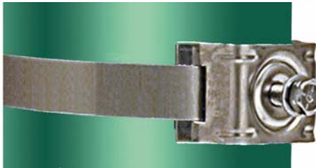
Flared Leg Brack-It mounted to a pole