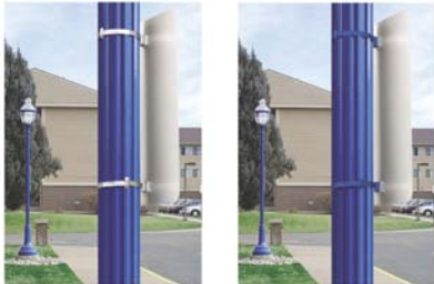
Before After Decorative Coated Band