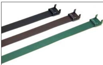
Decorative Coated Free End Band