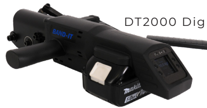
DT2000 Digital Banding Tool